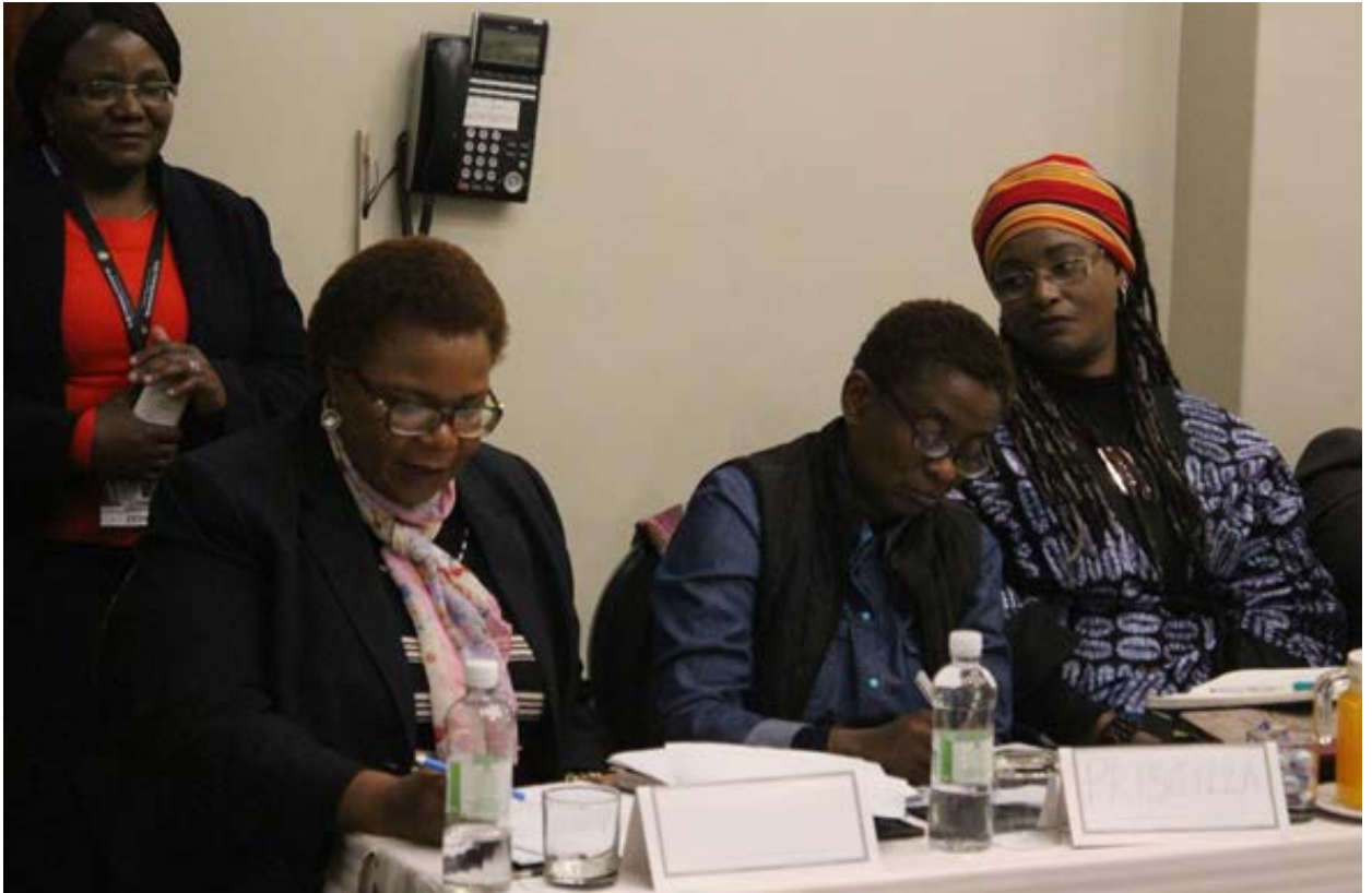
ZESN National Director Briefing the ESN-SA Observer Mission