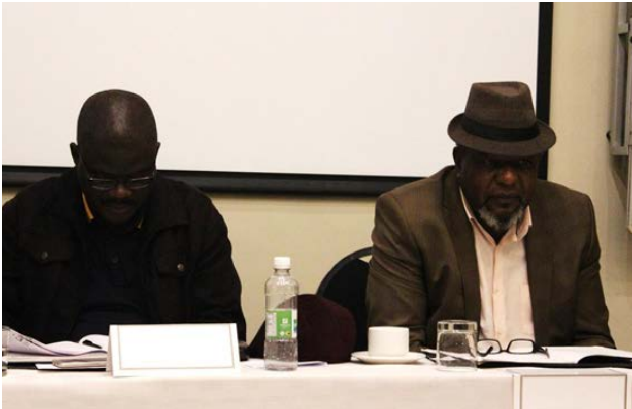
Briefing from representatives of the MDC Alliance