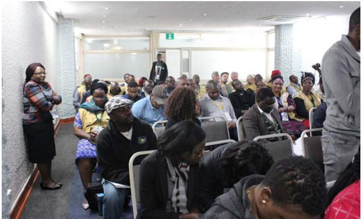
Snapshot of those who attended the Eminent Persons Observer Mission Press Conference on their Arrival Statement