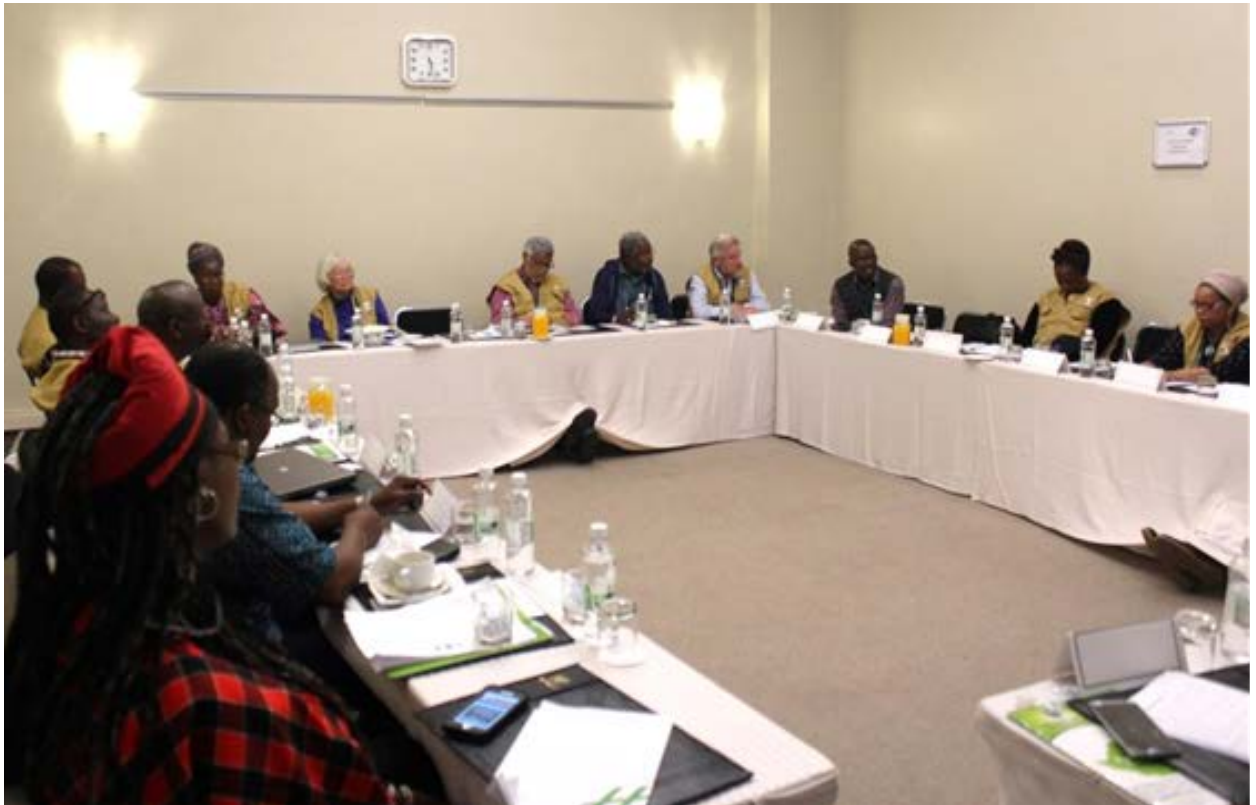
Post-election day de-briefing session