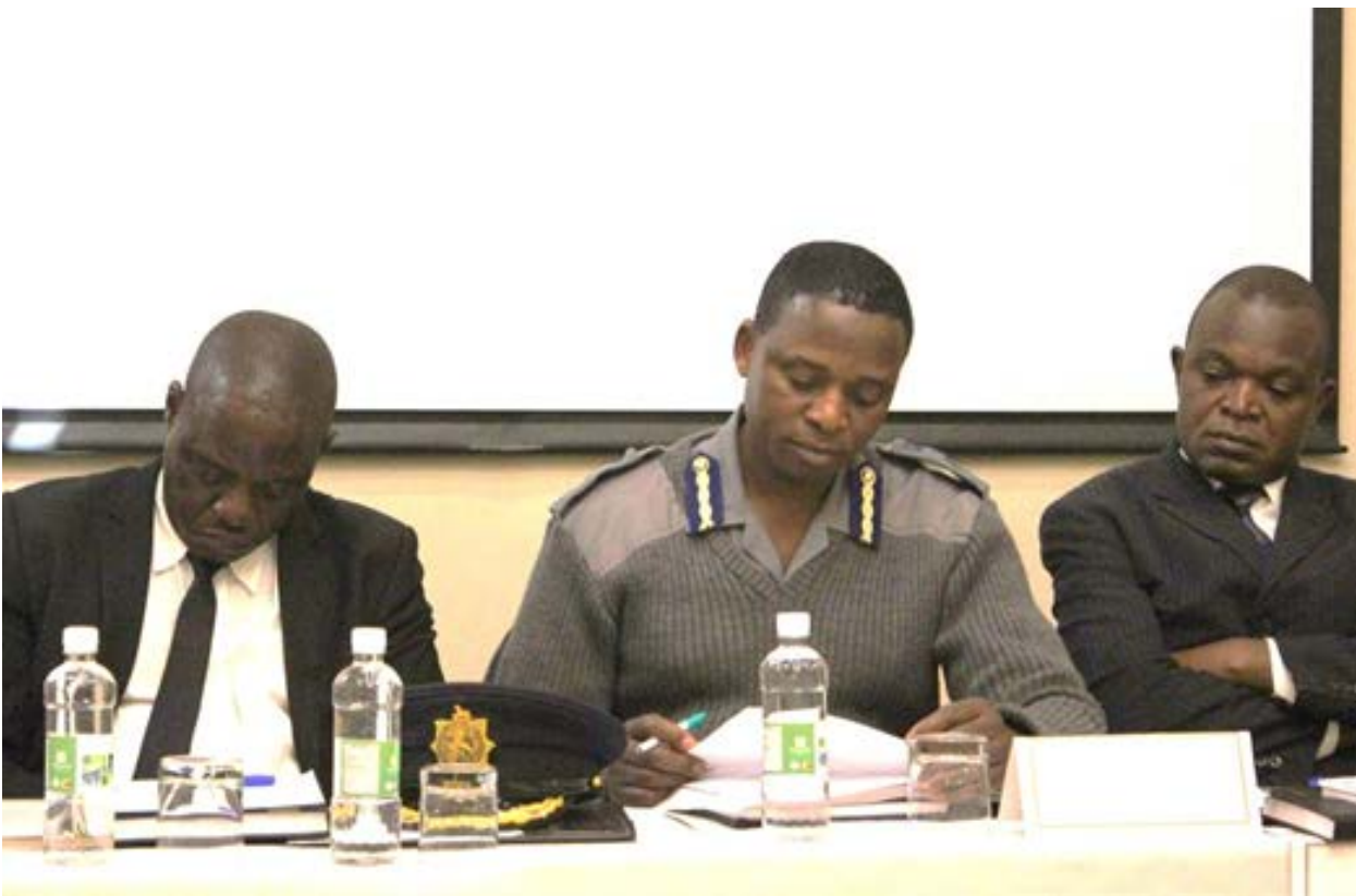
Briefing from the Zimbabwe Republic Police